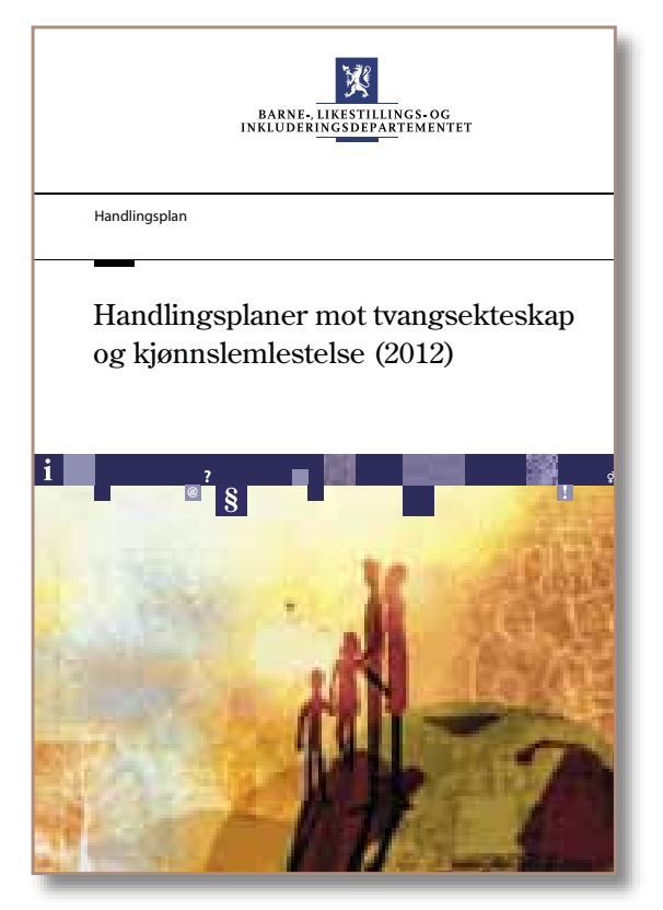
From 2012, the mandate was expanded to include female genital mutilation in addition to forced marriages.

In this report, only the article about the integration counsellor's experiences from the Embassy in Nairobi, Kenya, discusses female genital mutilation. This is linked to the integration counsellor in question covering Somalia and the Horn of Africa, where many refugees and immigrants in Norway come from, and where female